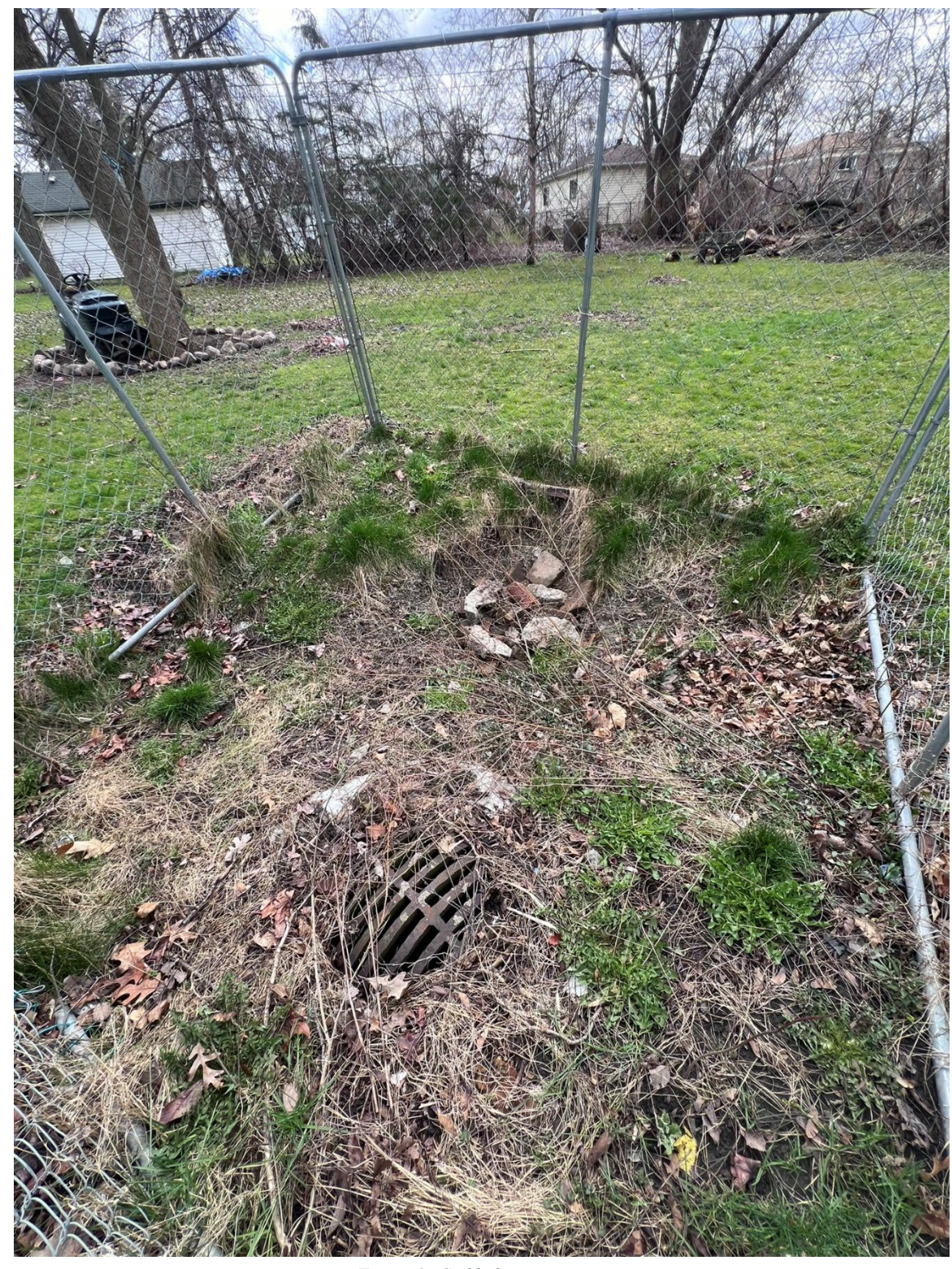
Figure 1 - Sinkhole