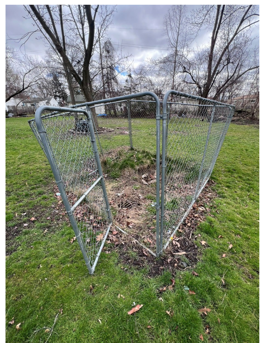
Figure 2 - Sinkhole